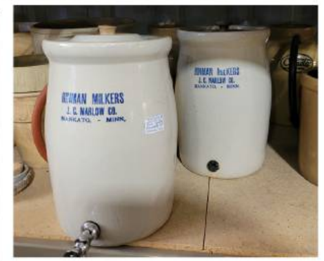
2 Hinmans both Mankato Uhl???