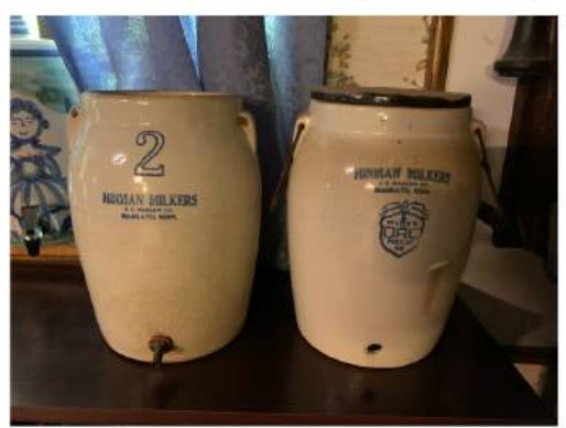
2 Hinmans, both Mankato with handles. Uhl!