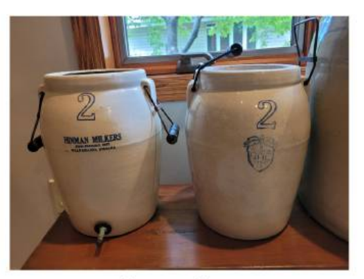
Hinman from Valparaiso beside a handled Uhl!