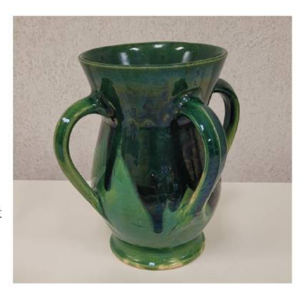
Jane Uhl 4 handled mug

Check out the pictures of the Convention and Happy Uhling Everyone!